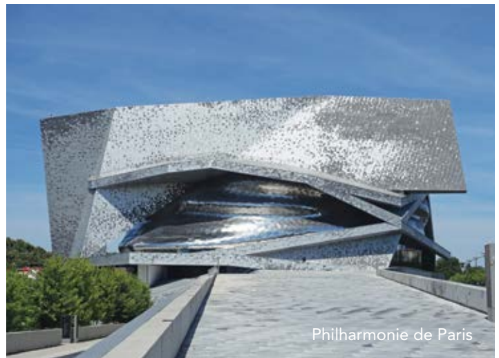
Philharmonie de Paris