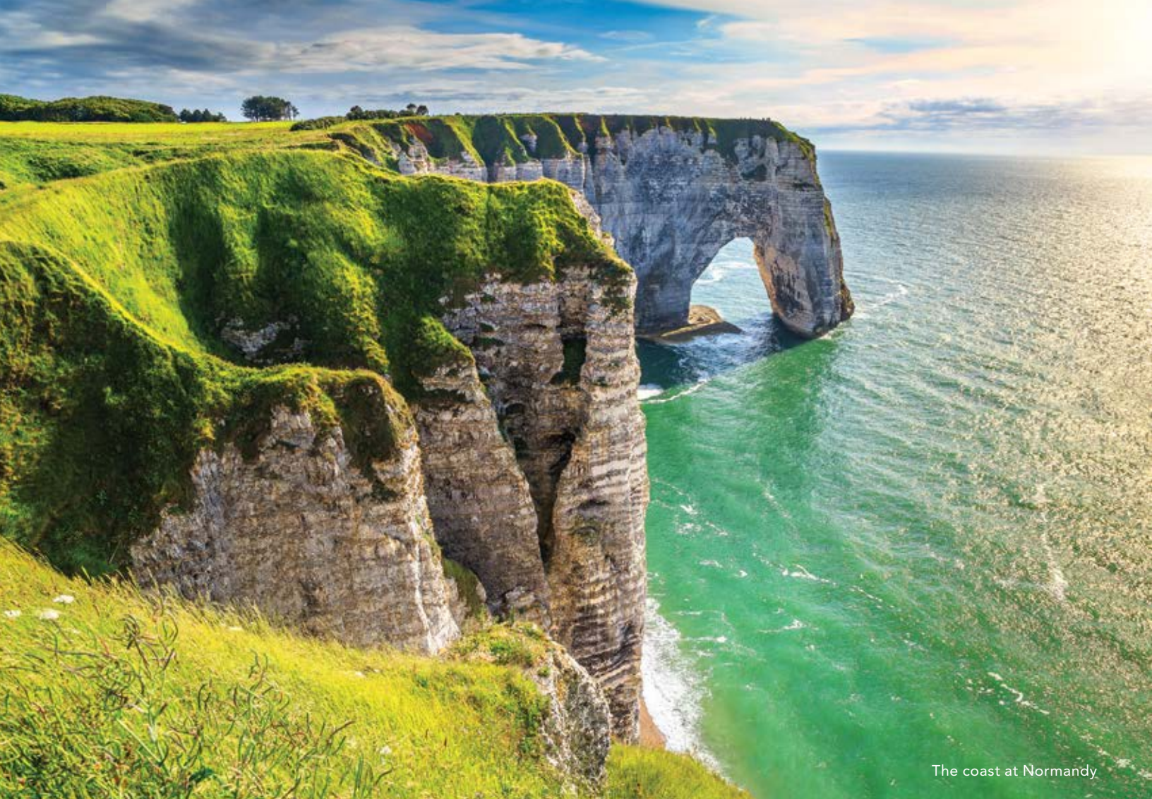
The coast at Normandy

For more information and to reserve your space call 800-723-8454 or visit www.earthboundexpeditions.com