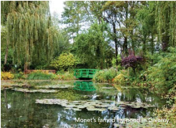
Monet's famed lily pond in Giverny

Time-permitting, we'll have an opportunity for another fun excursion before returning to the Amadeus Diamond for dinner. (B,L,D)*