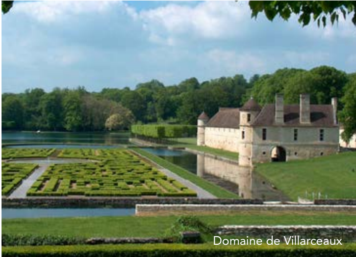
Domaine de Villarceaux