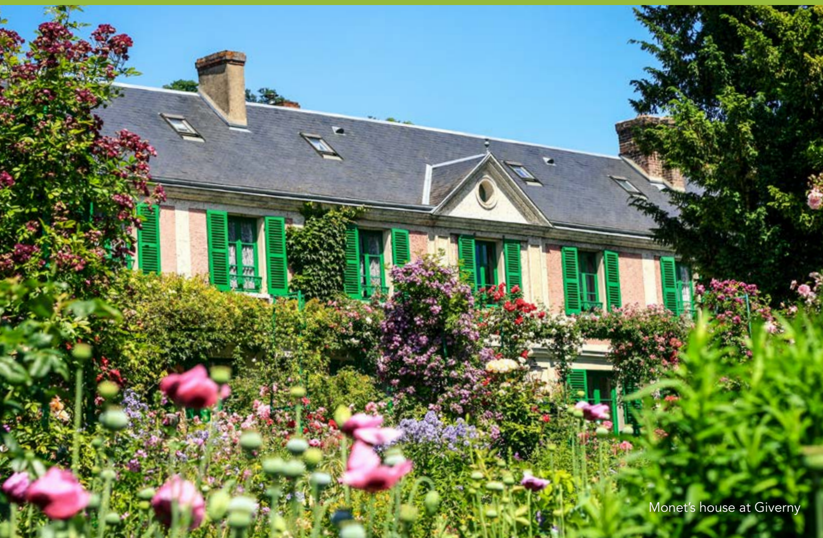
Monet's house at Giverny